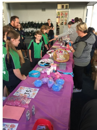
Carers Group Stalls