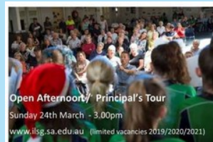
Open Afternoon / Principal's Tour Sunday 24th March - 3.00pm www.ilsg.sa.edu.au (limited vacancies 2019/2020/2021)