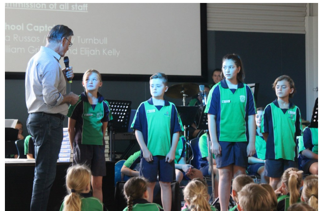
Installing our Student Leaders