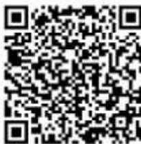
Absentee eForm QR code

We encourage parents to use the Student Absentee Operoo form which can be located in your Forms Library, simply click on the form, fill in and submit. We are asking parents do NOT email teachers and front office staff directly to report Absentees, as these staff members may be absent too.