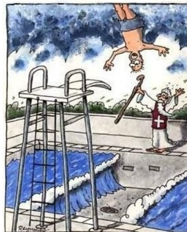
Moses' first and last day as a lifeguard.

He was an ordinary bloke who with God's grace and power did extraordinary things. Great news for us ordinary blokes!!