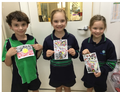
Naidoc Week Art