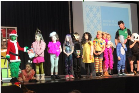
Book Week Dress Up Parade