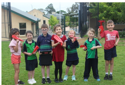
Dyslexia Light it Red Day